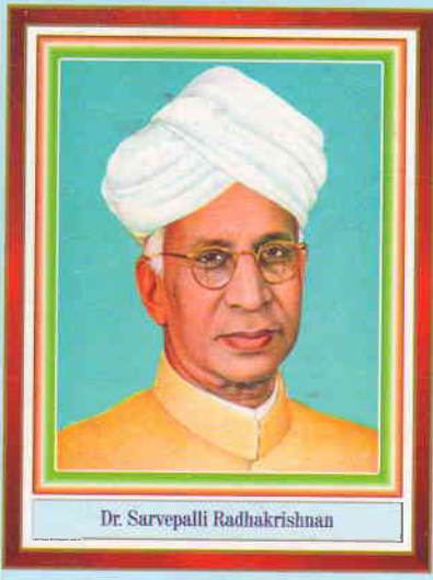
Dr. Sarvepalli Radhakrishnan